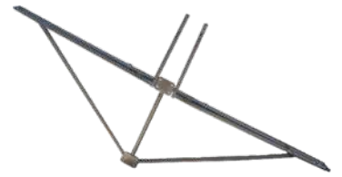
Tandem side folding boom for lattice mast 470mm, 2*250cm long, 25mm - 55cm vertical tube inox