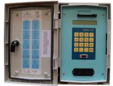
Datalogger Stylitis 101 with 3 counters and 0 analog channels