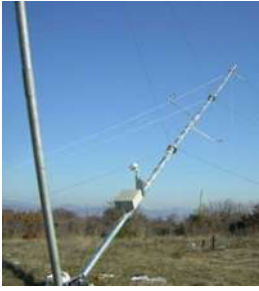
Gin pole 6m long 130mm for 20m mast