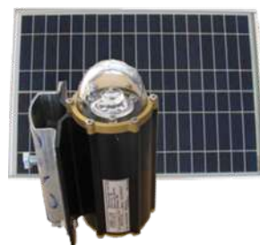
Civil aviation lamp 32 cd complete SET, including 44 m cable, 20watt pv, battery, protection box. Suitable for lattice mast. Code: 08.02.007.SET