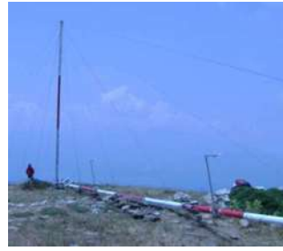
Gin pole 9m long for 30 – 40m mast using tubes of 130mm