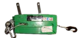
300kg Winch to raise and lower 10m masts