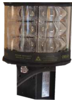
Civil aviation lamp 2000 cd 24 Volt Code: 08.02.002