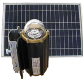
Civil aviation lamp 32 cd complete SET, including 30 m cable, 20watt pv, battery, protection box. Suitable for 130mm or 152mm tubular mast. Code: 08.02.003.SET