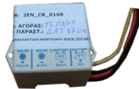
PV charger morning star 12volt