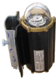
Civil aviation lamp 32cd Code: 08.02.001