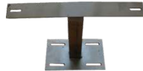
PV boom 10-20 Watt 130mm inox