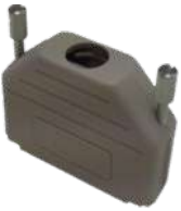
One counter channel card (n°22) for Stylitis 101