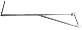
Side boom for lattice mast 360mm, 202cm long, 25mm vertical tube inox