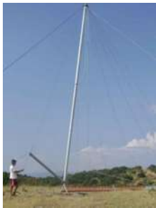
Gin pole 12m long suitable for 54m lattice mast using tubes of 152mm