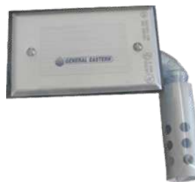
Humidity sensor (NRG) Code: 10.04.000