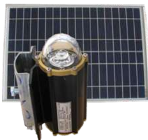
Civil aviation lamp 32 cd complete SET, including 54 m cable, 20watt pv, battery, protection box. Suitable for lattice mast. Code: 08.02.008.SET