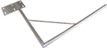
Lightning protection side boom Ø130mm inox