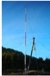
Gin pole 9m long 152mm for 40m mast not including rope, shackles and lifting bracelet