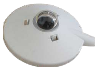
Pyranometer CMP3 Code: 10.05.002