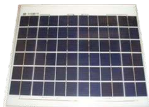
PV 10 watts