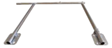
Lightning protection side boom for lattice tower suitable for aluminium lightning protection 10-16*3000 25mm inox