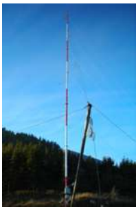
Gin pole 9m long for 40m mast using tubes of 152mm