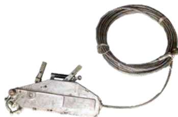
1600kg Winch including 20m guy wire to raise and lower 30m – 40m masts