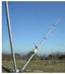
Gin pole 6m long 130mm for 20m mast not including rope, shackles and lifting bracelet