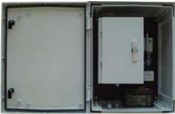
Datalogger protection box Arial 54