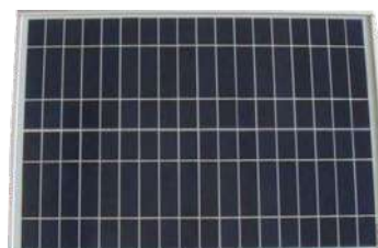
PV 20 watts