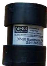
Barometer (NRG) Code: 10.02.000