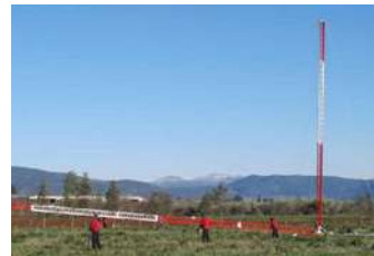
Lattice 360mm gin pole 15m long suitable for 65m lattice mast including 6m 130mm tubular auxiliary gin pole