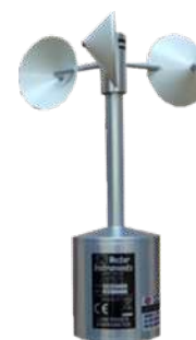
Anemometer Vector A100LK/PC3 with lightning protection Code: 10.01.025