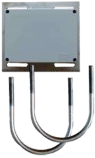
Junction box. Suitable for 70mm up to 152mm tubular mast