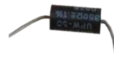
Resistance, high precision 350 Ohm (to connect PT100 to Stylitis 41 data logger) Code: 25.18.00.001