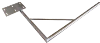
Lightning protection side boom Ø152mm inox