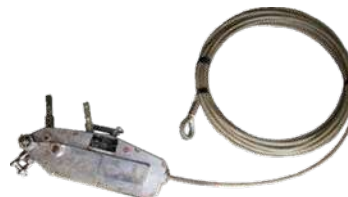
3200kg Winch including 20m guy wire to raise and lower 40m – 65m masts