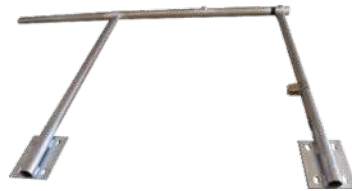
Lightning protection side boom for lattice tower (FRANKLIN) 35mm inox