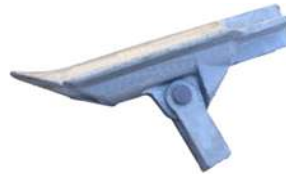
Arrow Head anchors 5/8 (9*30cm)