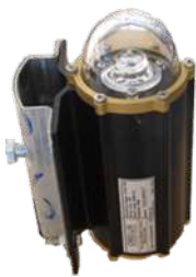
Civil aviation lamp 10cd Code: 08.02.000