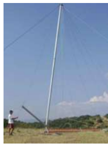
Gin pole 12m long 152mm suitable for 54m lattice mast not including rope, shackles and lifting bracelet