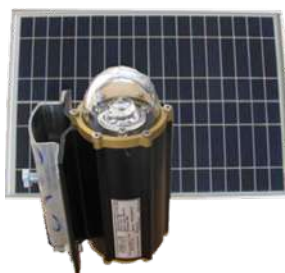
Civil aviation lamp 32 cd complete SET, including 40 m cable, 20watt pv, battery, protection box. Suitable for 130mm or 152mm tubular mast. Code: 08.02.004.SET