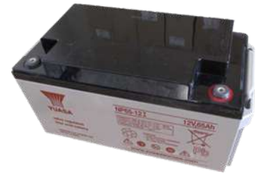
Battery 12volt 65Ahr YUASA