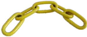
Chain LASHING per meter