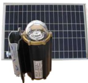
Civil aviation lamp 10 cd complete SET, including 40 m cable, 20watt pv, battery, protection box. Suitable for 130mm or 152mm tubular mast. Code: 08.02.006.SET