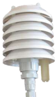
Temperature sensor NRG #110S Code: 10.03.001