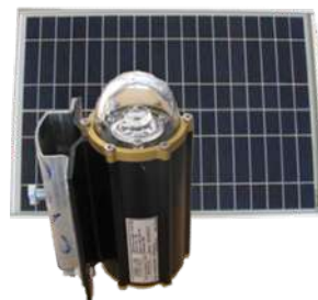
Civil aviation lamp 10 cd complete SET, including 30 m cable, 20watt pv, battery, protection box. Suitable for 130mm or 152mm tubular mast. Code: 08.02.005.SET