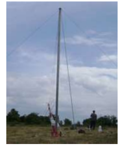
Gin pole 9m long 152mm suitable for 44m lattice mast not including rope, shackles and lifting bracelet