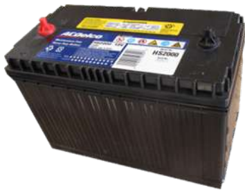
Battery 115 Ahr