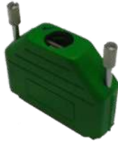
Three analog channels card (n°12) for Stylitis 101