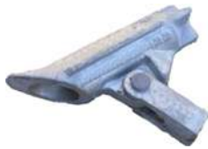
Arrow Head anchors 5/8 (6.5*20cm)