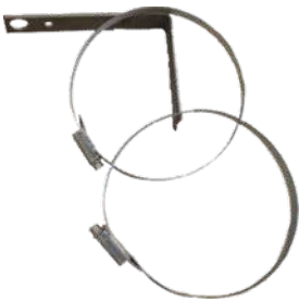
Side boom for Vector thermometer