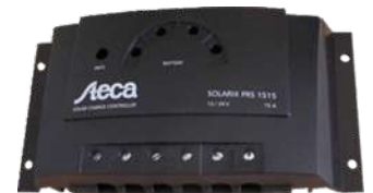
PV charger 24volt STECA SOLSUM 10.10