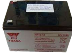
Battery 12volt 12Ahr YUASA