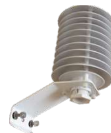
Combined temperature and humidity sensor (Rotronic) Code: 10.05.001