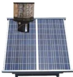
Civil aviation lamp 2000 cd complete SET, including 54 m cable, 100watt pv, batteries, protection box. Suitable for lattice mast. Code: 08.02.009.SET