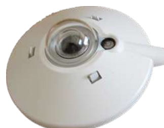
Pyranometer CMP6 Code: 10.05.003