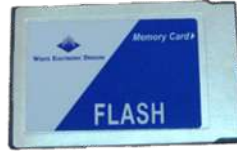
Flash memory card