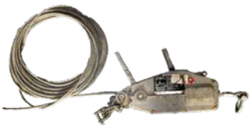
800kg Winch including 13m guy wire to raise and lower 10m – 20m masts