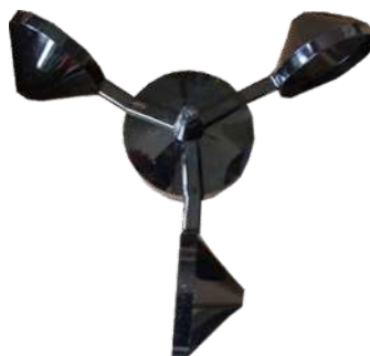
Anemometer NRG ISO 17025 & MEASNET calibrated Code: 10.01.034