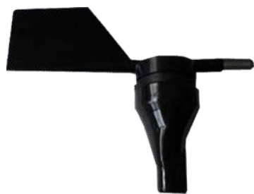
Windvane NRG Code: 10.00.000