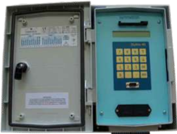
Datalogger Stylitis 41 with 3 counters and 4 analog channels