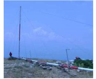
Gin pole 9m long 130mm for 30 – 40m mast not including rope, shackles and lifting bracelet