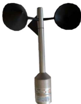
Anemometer Thies 1st class Code: 10.01.004