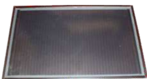
PV 5 watts