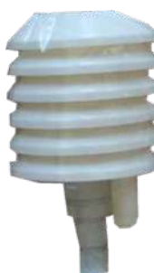
Thermometer Vector T351 1/3DIN Code: 10.03.000