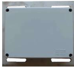
Junction box. Suitable for lattice mast