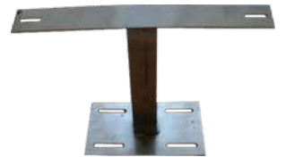
PV boom 10-20Watt 152mm inox