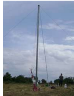
Gin pole 9m long suitable for 44m lattice mast using tubes of 152mm