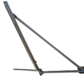
Side folding boom for lattice mast 470mm, 250cm long, 25mm - 55cm vertical tube inox