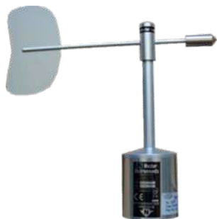
Windvane Vector W200P Code: 10.00.001